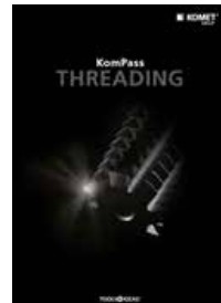
KOMPASS Threading 3990102704