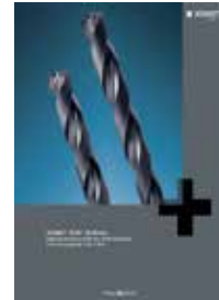
KUB Drillmax 3990203729