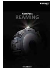
KOMPASS Reaming Catalog 3990202703