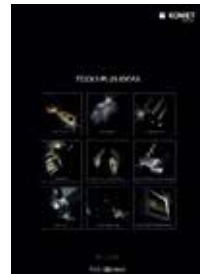
TOOLS PLUS IDEAS Catalog (15/16) 3990102604