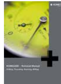
KomGuide Technical Booklet 3990109900