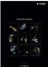
TOOLS PLUS IDEAS Catalog (16/17) 3990102604