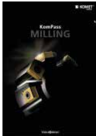
KomPass – Milling (Inch) 3990100404