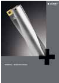
KOMPASS Bore Machining Catalog 3990202603