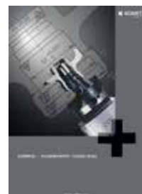
Facing Heads Brochure 3992201000