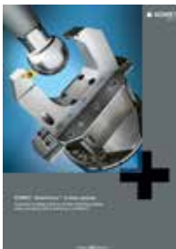
KomTronic U-Axis Brochure 3990193230