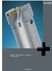
KUB Centron Powerline 3990296831